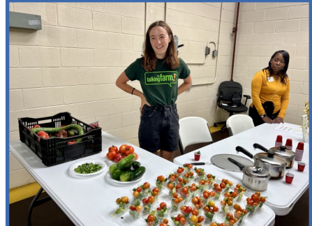
Community Partner: Talking Farm provides samples of their farming bounty!