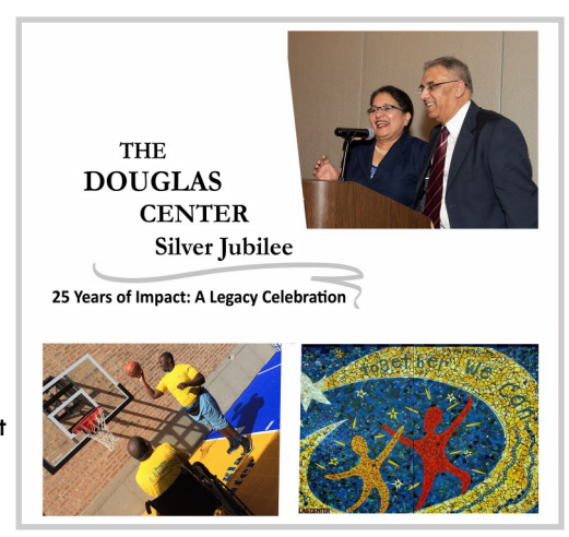
In 2024 The Douglas Center will celebrate 25 Years of Service to individuals with special needs. Stay tuned for the details!

To celebrate this major milestone in our history, The Douglas Center has something very special in store. Stay tuned for exciting details about the upcoming celebration.